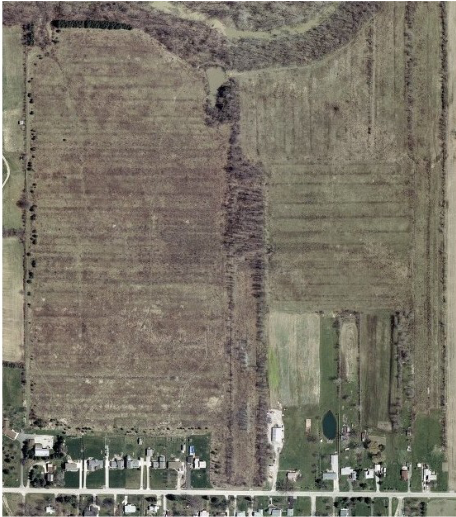
Site before restoration - 2001