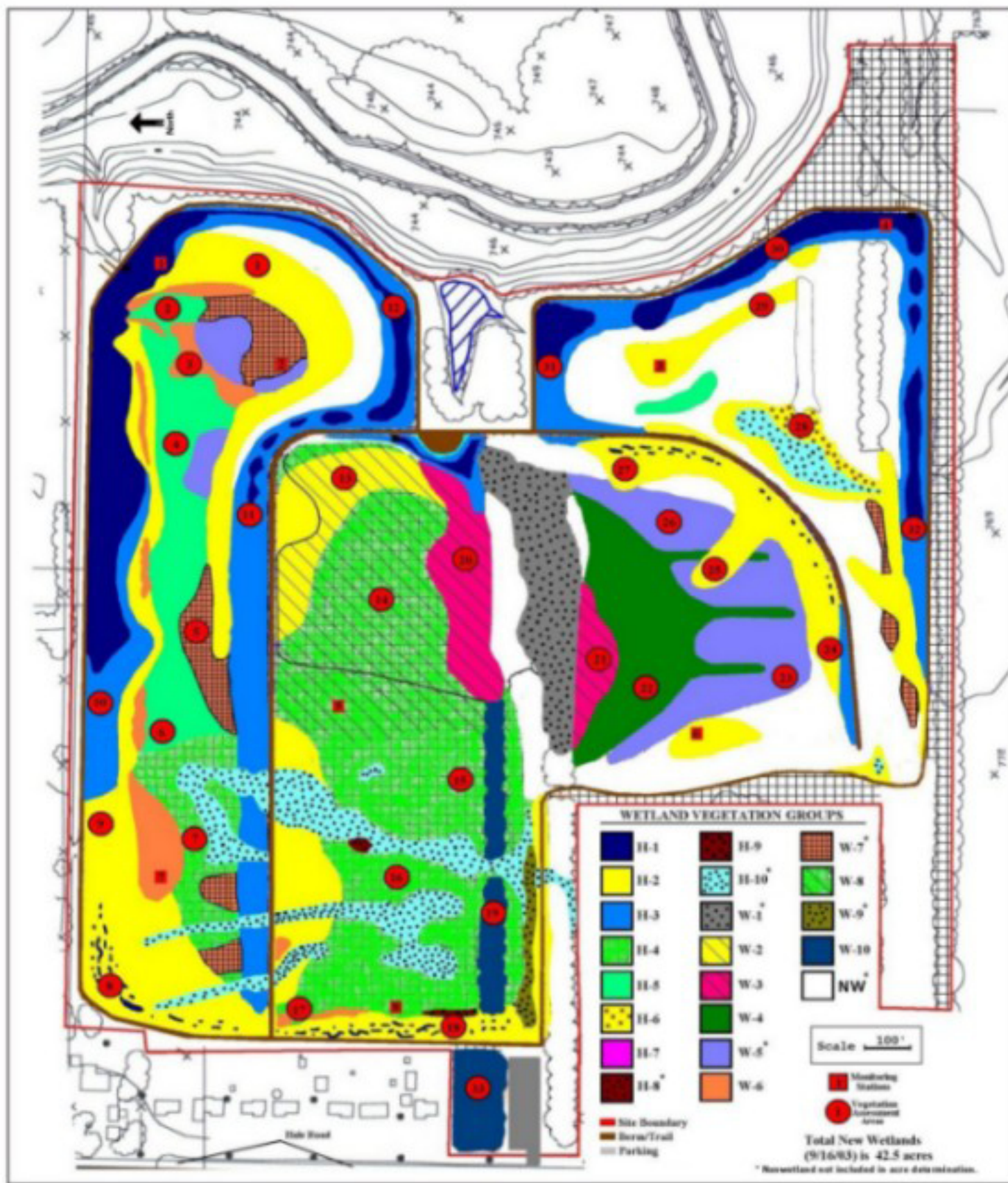
Vegetation communities mapped in 2005